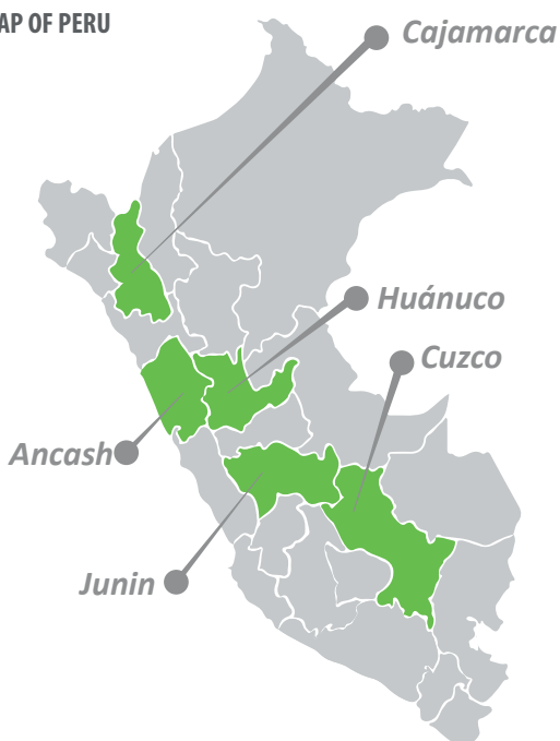
MAP OF PERU